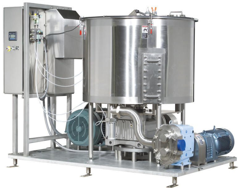
Different pumps available for various applications