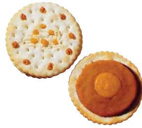
CHOCOLATE AND STRAWBERRY CREAMS