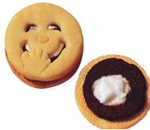
CHOCOLATE AND VANILLA CREAMS