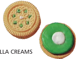
MINT AND VANILLA CREAMS