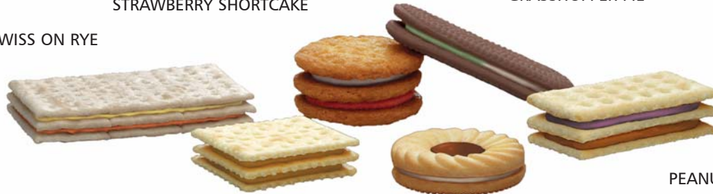
HONEY BUTTER DELIGHT