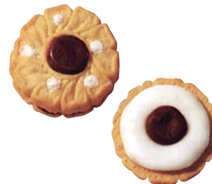
VANILLA AND CHOCOLATE CREAMS