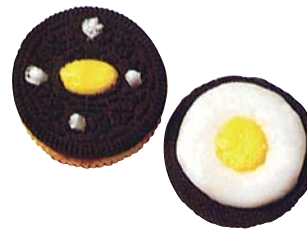
VANILLA AND BANANA CREAMS