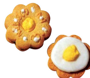
VANILLA AND BANANA CREAMS