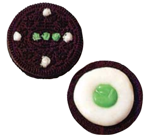
VANILLA AND MINT CREAMS